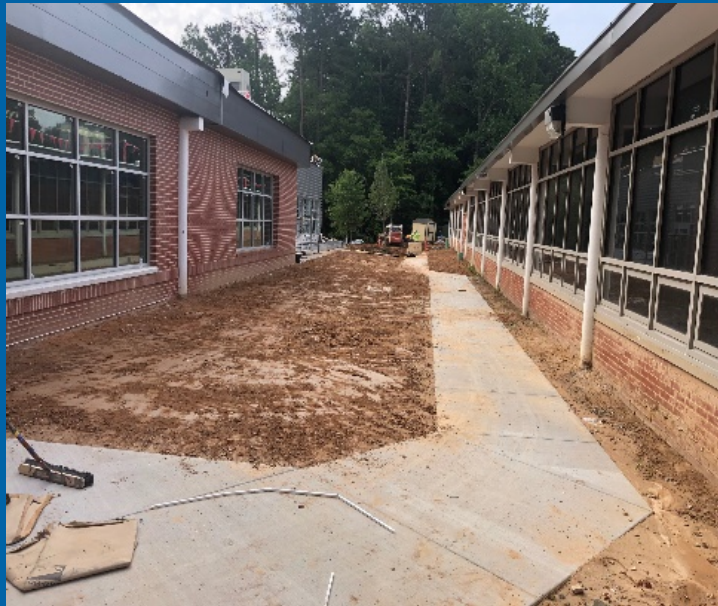
Gym/Renovation Final Grade