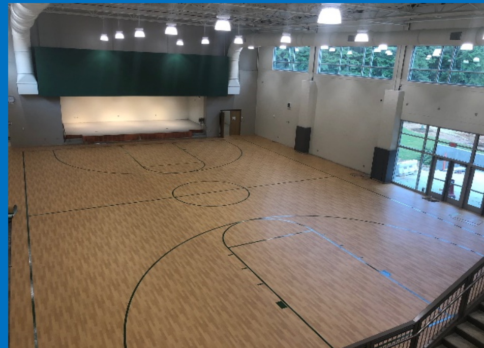
Gymnasium Flooring and Striping