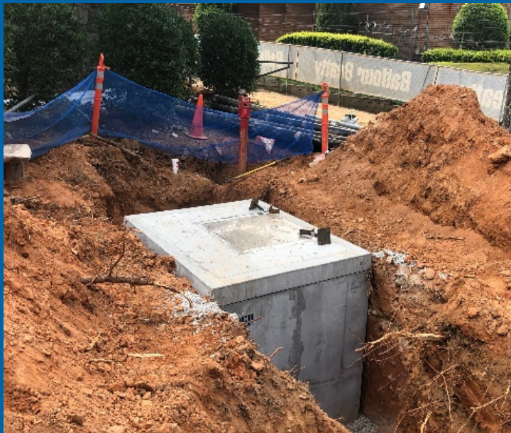
New Water Vault Installation