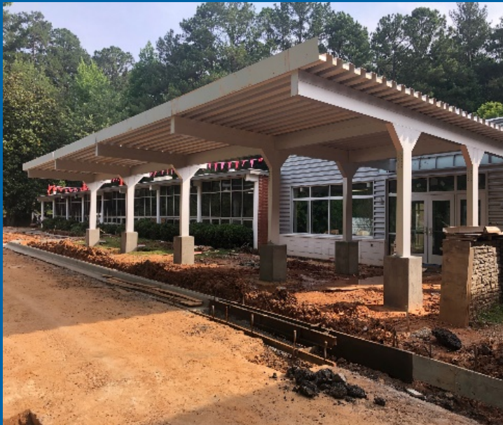
Main Entrance Canopy/Curb Installation