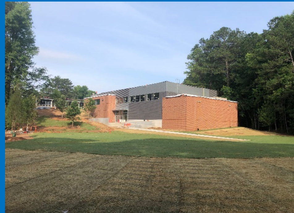
Gymnasium Sodding and Landscaping