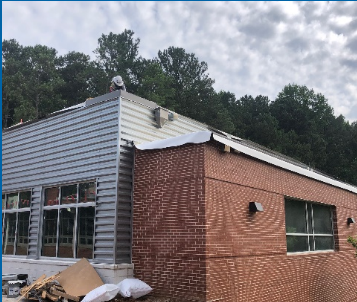
Gymnasium Roof Metal Installation