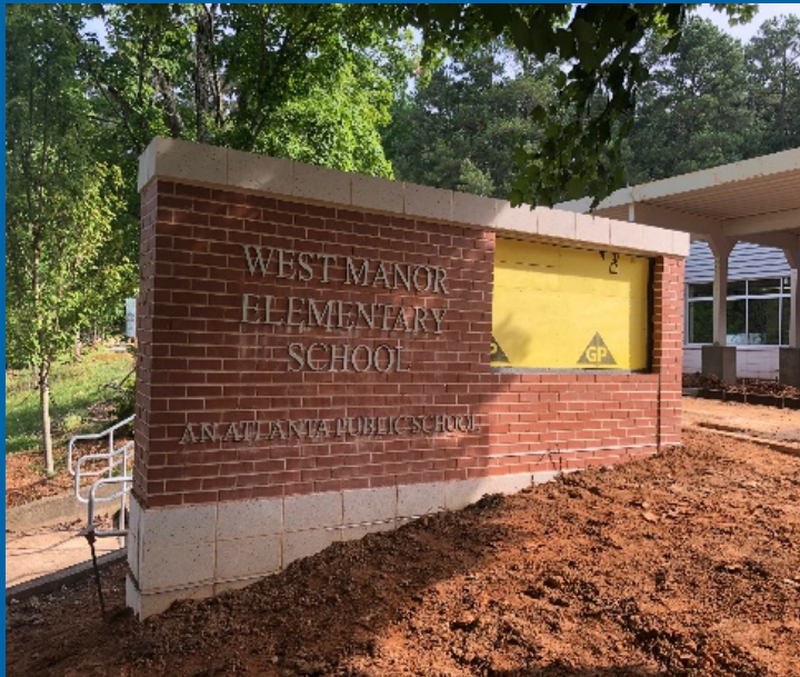
Monument Sign Progress